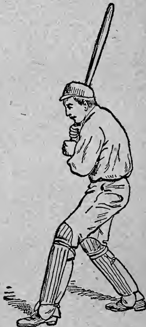
THE OFF-HIT, SHOWING THE COMMON MISTAKE OF BENDING THE RIGHT KNEE.

And mind that, as in forward play, your step